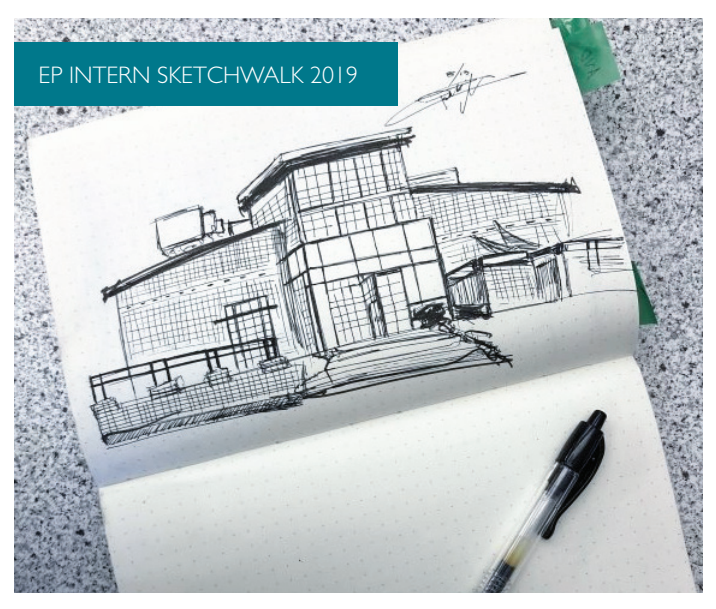
Sketch of the Lionakis Sacramento office completed by Interiors Intern Patrick Sasan