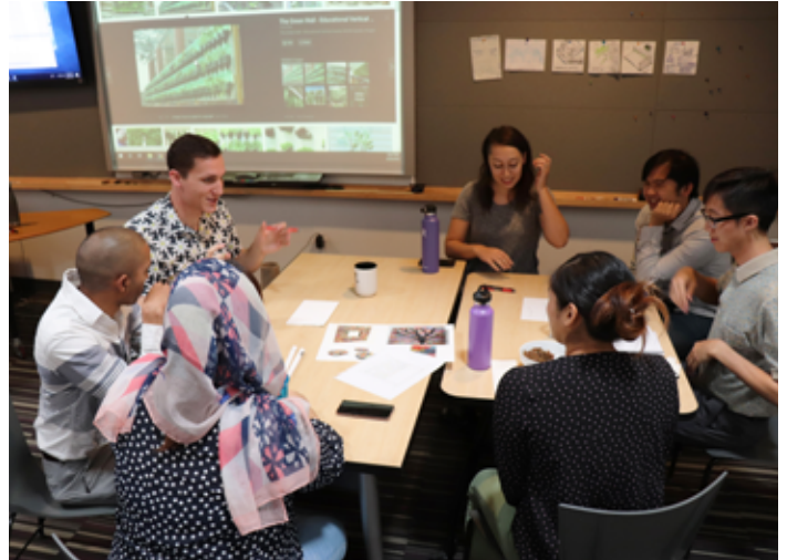
EPs collaborate on annual Parking Day design