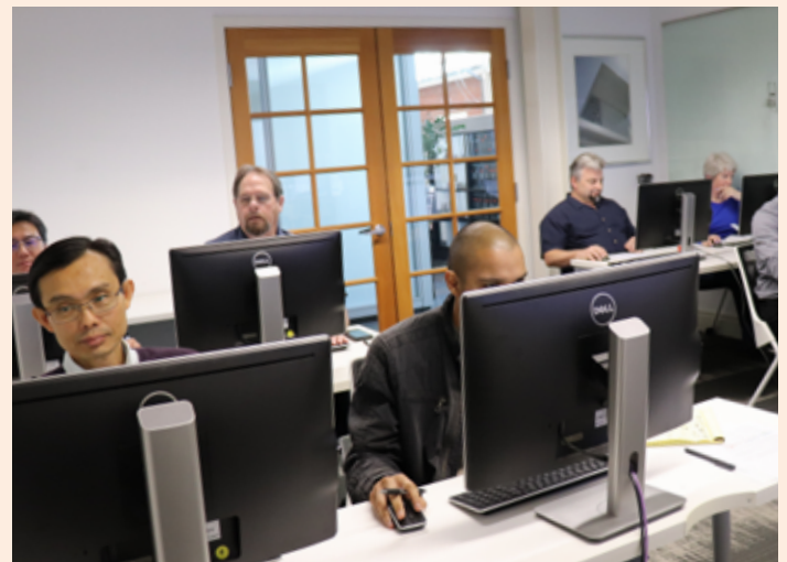
Attendees learning about Revit Add-Ins to enhance their daily work