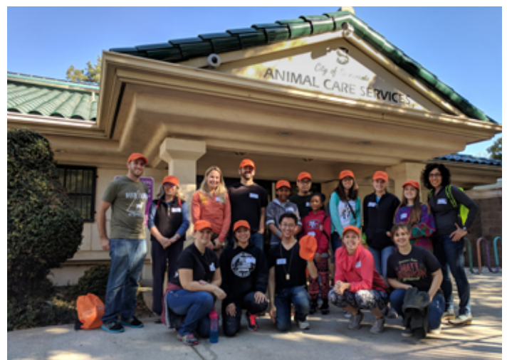
Volunteer Event at the Front Street Animal Shelter (Sacramento, CA)