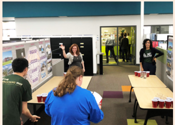
Education Studio DESIGNbar interactive trivia