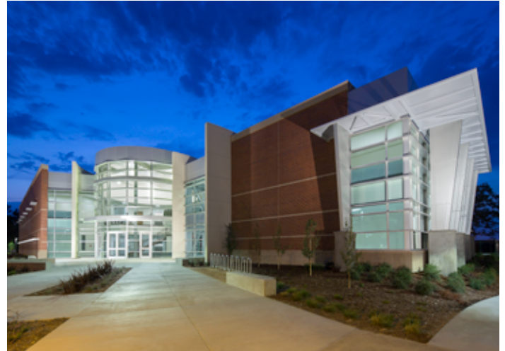
LEED Platinum: Winn Center, Consummes River College