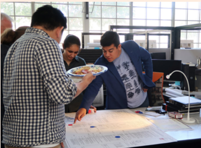
Civics Studio DESIGNbar

At Lionakis, we are always looking to "raise the bar" when it comes to design. We do this in both formal and informal ways. Our DESIGNcrit process invites those outside a project team to constructively critique each significant project, early and often, focusing on the client's key goals. We hold bi-monthly DESIGNbars , hosted once yearly by each market and service in the firm, share projects in progress, and connect with coworkers – all while having some fun. Our doDESIGN program is a series of "lunch and learns" where we conduct design phase training – from master planning to computational design – to highlight the best practices and projects throughout the firm.