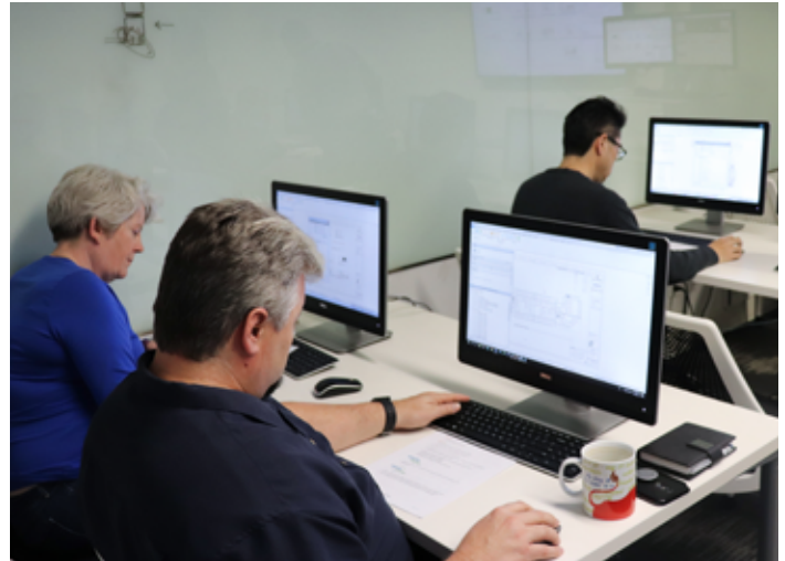
Attendees from all studios tackling design technology exercises