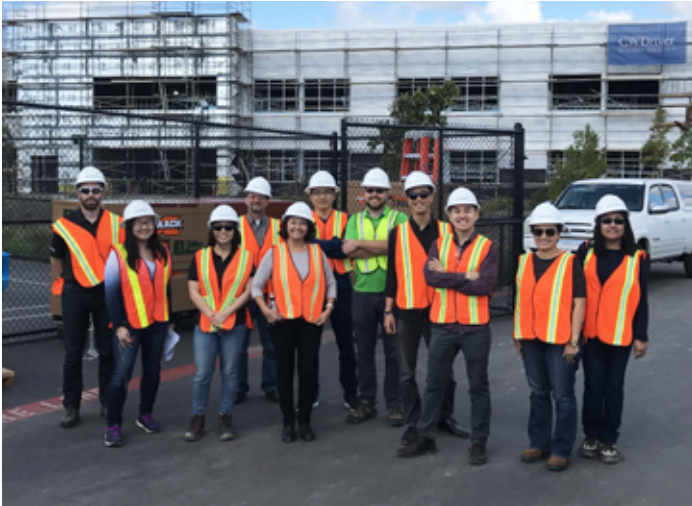
Pacific Trails Middle School, San Dieguito Union High School District

Our EPs regularly visit construction sites on a guided tour with the design team. Site visits allow you to see construction and coordination issues first hand while building relationships with clients, coworkers, and industry partners.