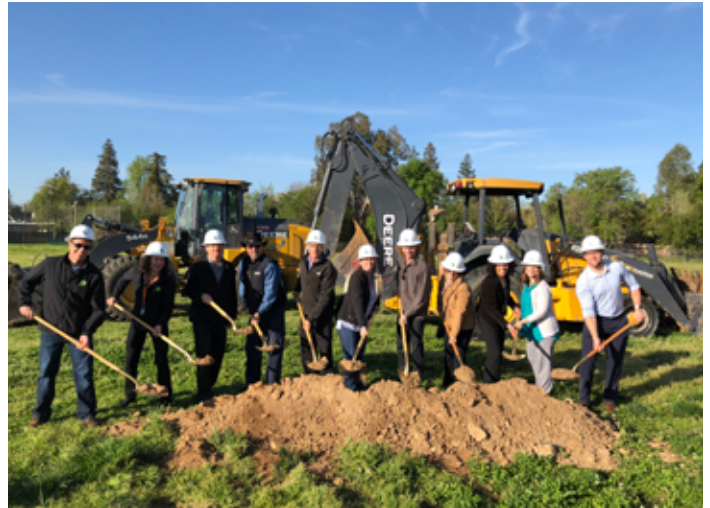
Groundbreaking at Dyer-Kelly Elementary School, San Juan USD