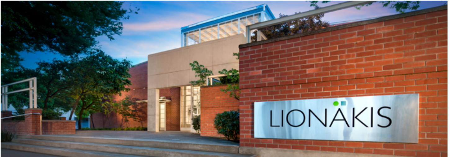
Headquarter office in Sacramento, CA