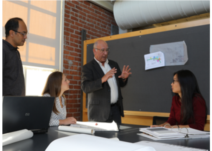
Mentorship and knowledge-sharing

Mentorship is critical to the success of all our emerging professionals. We provide both day-to-day project coaching and a formal mentorship program that pairs you with a senior staff member to help guide you through your career.