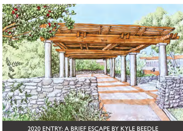
2020 ENTRT: A BRIEF ESCAPE BT RTLE BEEDLE