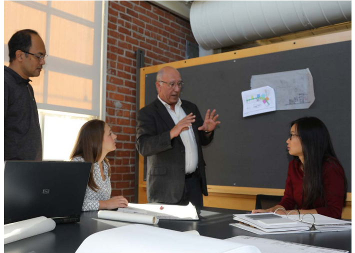
Mentorship and knowledge-sharing

Mentorship is critical to the success of all our emerging professionals. We provide both day-to-day project coaching and a formal mentorship program that pairs you with a senior staff member to help guide you through your career.