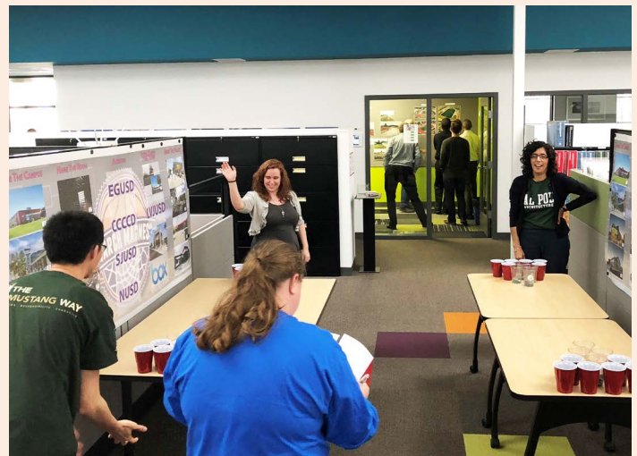
Education Studio DESIGNbar interactive trivia