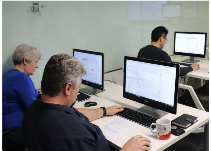
Attendees from all studios tackling design technology exercises