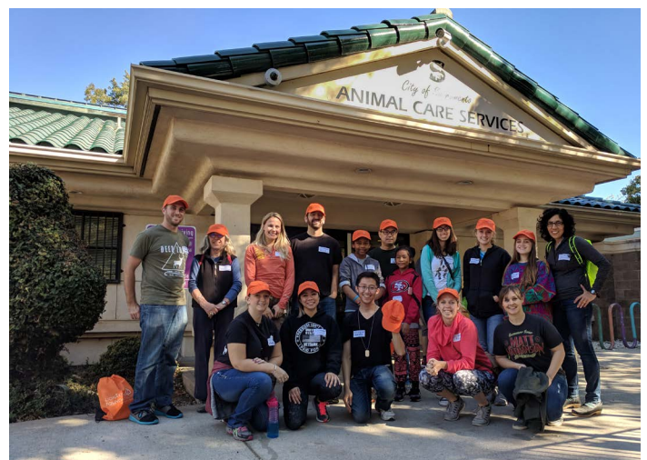
Volunteer Event at the Front Street Animal Shelter (Sacramento, CA)