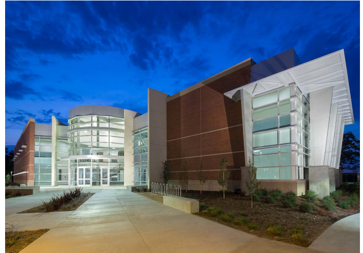
LEED Platinum: Winn Center, Consummes River College