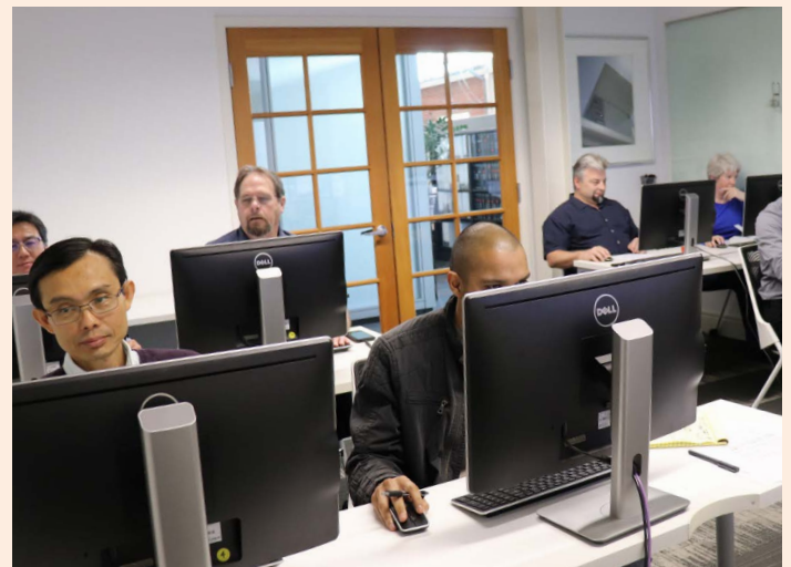
Attendees learning about Revit Add-Ins to enhance their daily work