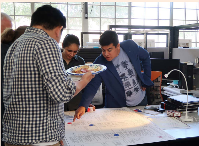
Civic Studio DESIGNbar

At Lionakis, we are always looking to “raise the bar” when it comes to design. We do this in both formal and informal ways. Our DESIGNcrit process invites those outside a project team to constructively critique each significant project, early and often, focusing on the client's key goals. We hold bi-monthly DESIGNbars , hosted once yearly by each market and service in the firm, share projects in progress, and connect with coworkers – all while having some fun. Our doDESIGN program is a series of “lunch and learns” where we conduct design phase training – from master planning to computational design – to highlight the best practices and projects throughout the firm.