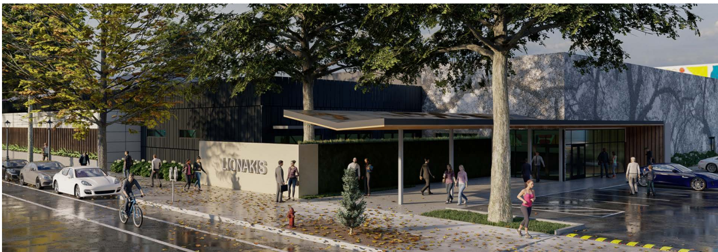
Future Headquarter office in Sacramento, CA