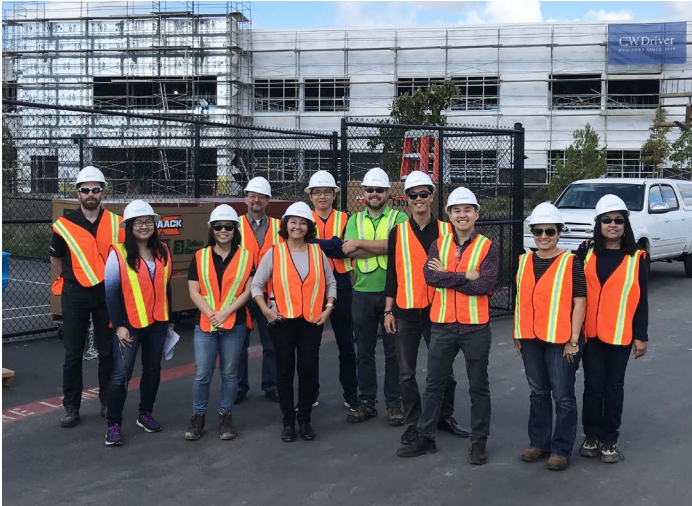
Pacific Trails Middle School, San Dieguito Union High School District

Our EPs regularly visit construction sites on a guided tour with the design team. Site visits allow you to see construction and coordination issues first hand while building relationships with clients, coworkers, and industry partners.