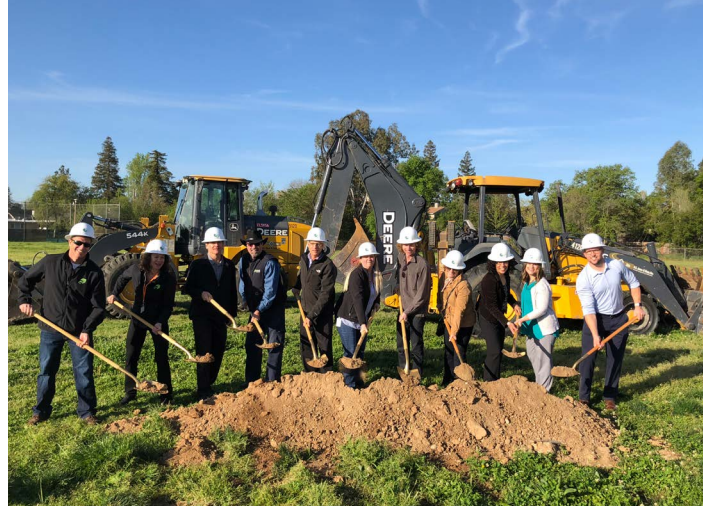
Groundbreaking at Dyer-Kelly Elementary School, San Juan USD