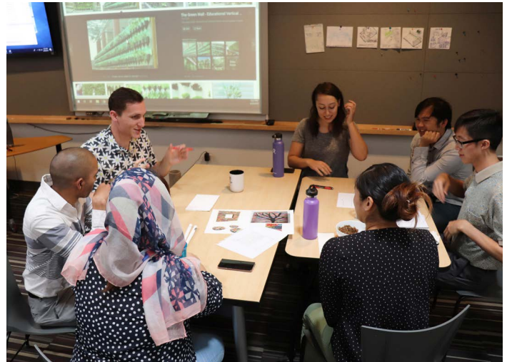
EPs collaborate on annual Parking Day design