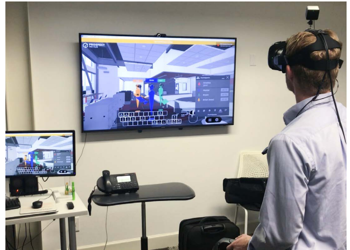
Designer 11 testing a new multi-person virtual reality tool